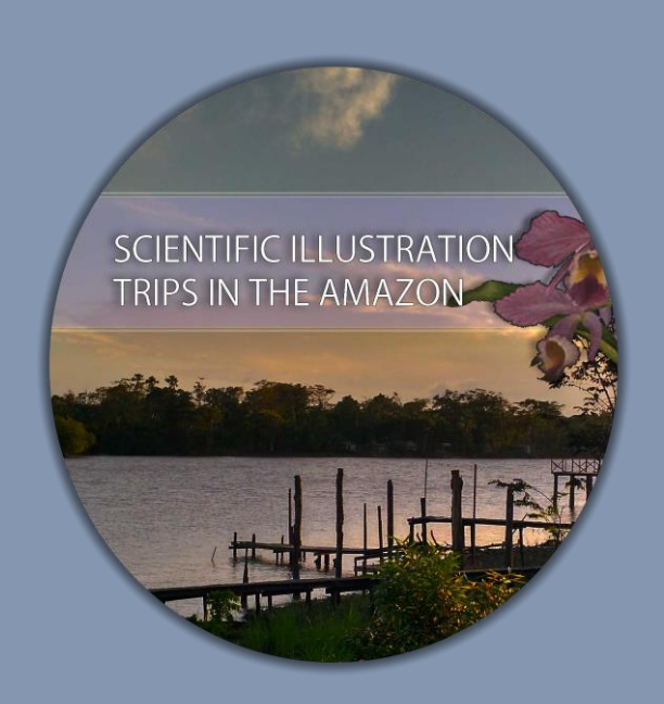
Coordinators Dulce Nascimento Gilberto Castro

Accommodations: In our boat, the "OTTER", built by in 2005, we enjoy the advantages of a small group (maximum of 18 passengers), in a great level of comfort. The boat is 88 feet long and 24.6 feet wide, has four decks, nine passenger cabins, 8 double cabins with large twin beds, one with a large double bed, individual air conditioning units in each cabin, all with private bathrooms with hot water showers. On the first deck we have the command, five passenger cabins, crew quarters, a kitchen and service areas. On the second deck we have 4 passenger cabins, a 350 square foot enclosed dining room, a small open veranda, and service areas. On the third deck we have 2 covered verandas, one in the front and one in the back, one sun deck area with a Jacuzzi tub and showers, a bar, a toilet and a nice 250 square foot enclosed living room. The fourth deck is a 360° panoramic sun deck. All cabins and bathrooms are external with large windows.